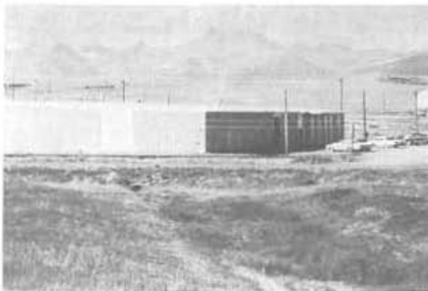
The 40,000 square foot plant is located near Glacier Park in Browning, Montana -- one of the coldest counties in the U.S.

So you see, there is more to the pencil than meets the eye. And by the way, the tribe says "Tsee-Ook-Ta-See-Tuki." In Blackfeet Indianese, that means "thank you".